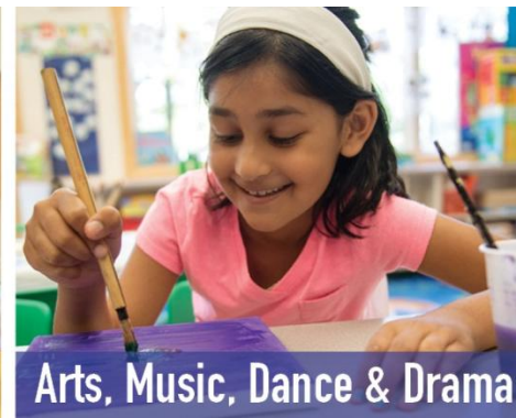
Arts, Music, Dance & Drama