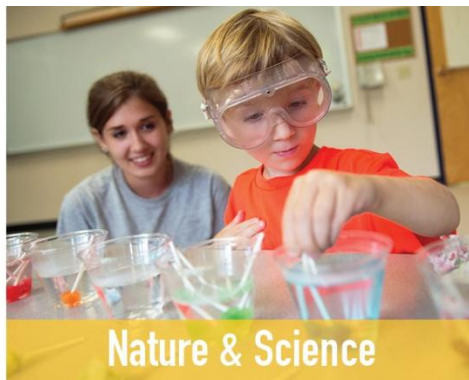
Nature & Science