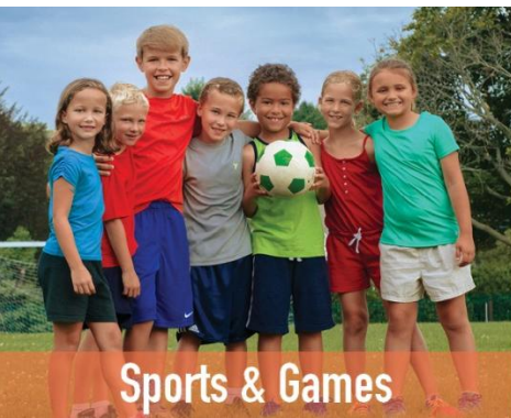
Sports & Games