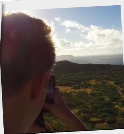
Expand your horizons