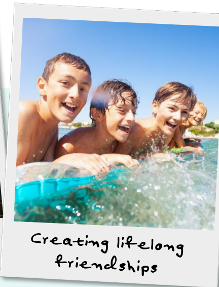
Creating lifelong friendships