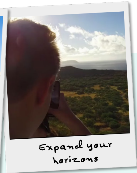
Expand your horizons