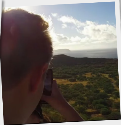
Expand your horizons