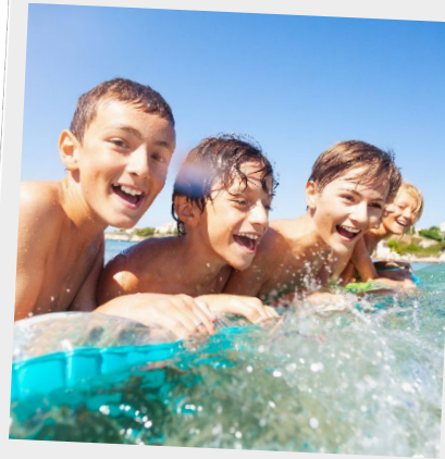
Creating lifelong friendships