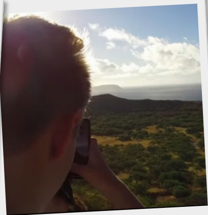
Expand your horizons