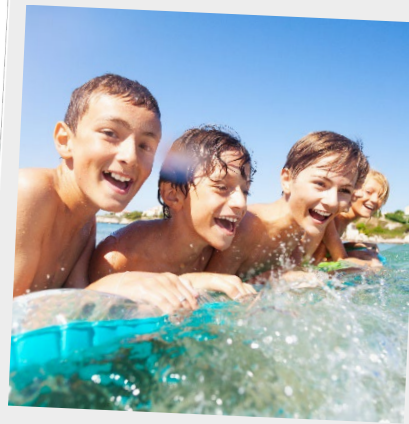
Creating lifelong friendships