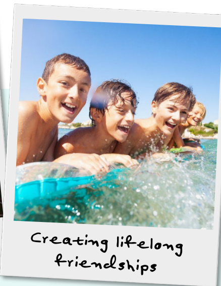
Creating lifelong friendships