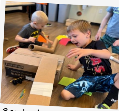
Sculpting Imagination into Reality