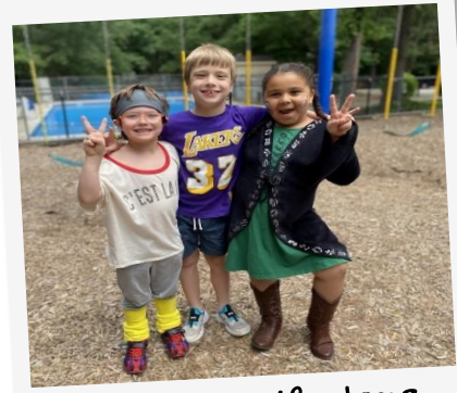
Creating Lifelong Friendships