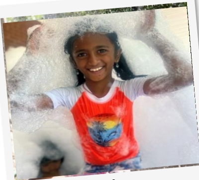
Carefree Summer Bliss