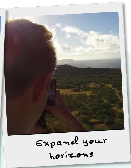
Expand your horizons