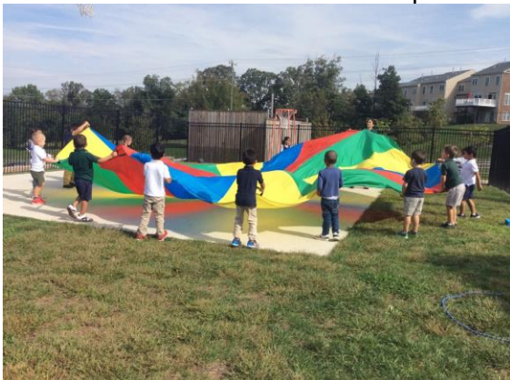
Pre-K A using the parachute on the playground

We look forward to the fun months we have planned ahead!