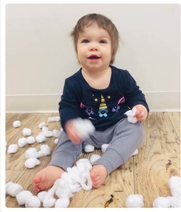
"Snow" much fun!

Friday, February 26th - Save the Date. Details on registration will be available online soon.