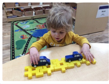
Building Roads to Success in our Beginner Room