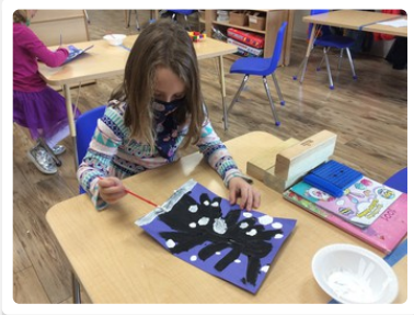
Creative Mind at Work