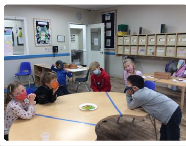
Skittle Science with our Club Connect